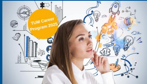
How to Discover Your Strengths Beyond Degrees and Job Titles 23 October 2025 - Webinar