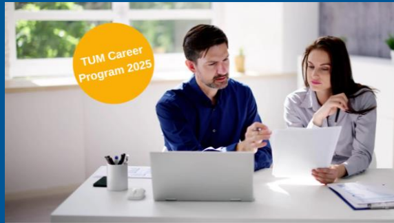
The Perfect CV for Your Application in Germany 20 October 2025 - Webinar