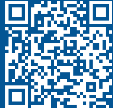
Engineers for Germany on LinkedIn