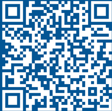
Engineers for Germany TUM Community Group