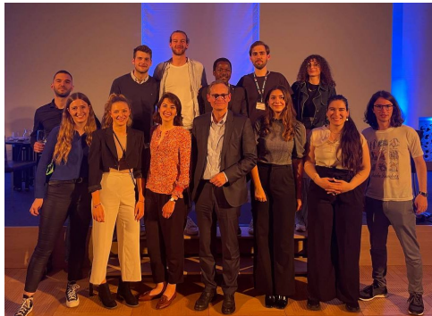
Scholarship event at Forum Maximilianeum