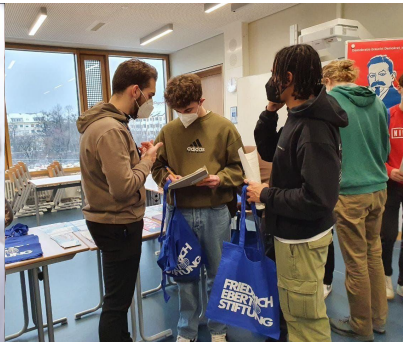
Scholarship info event at a High School in Munich