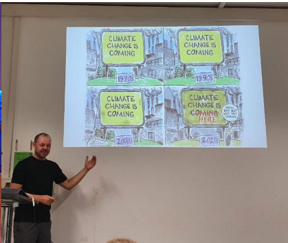
Lecture on Climate Crisis: Be aware, prevent, prepare