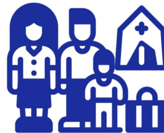
refugees and families with migrant background