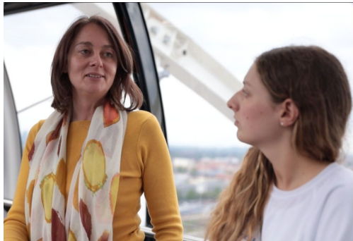
Conversation with Katarina Barley, VP European Parliament