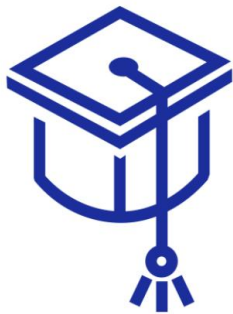
first member of the family to attend university